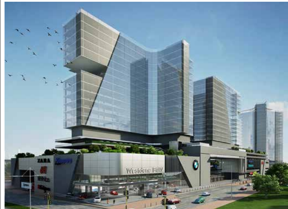
Mixed-use lifestyle precinct for Second Avenue, Bloemfontein