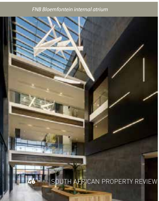
FNB Bloemfontein internal atrium

The practice has also been involved in pro-bono community work. Bomax designed an orphanage in Mozambique called Life Child, for children who have lost their parents to Aids; a project that is funded by the Life Church of Sea Point. With supplied brick machines and