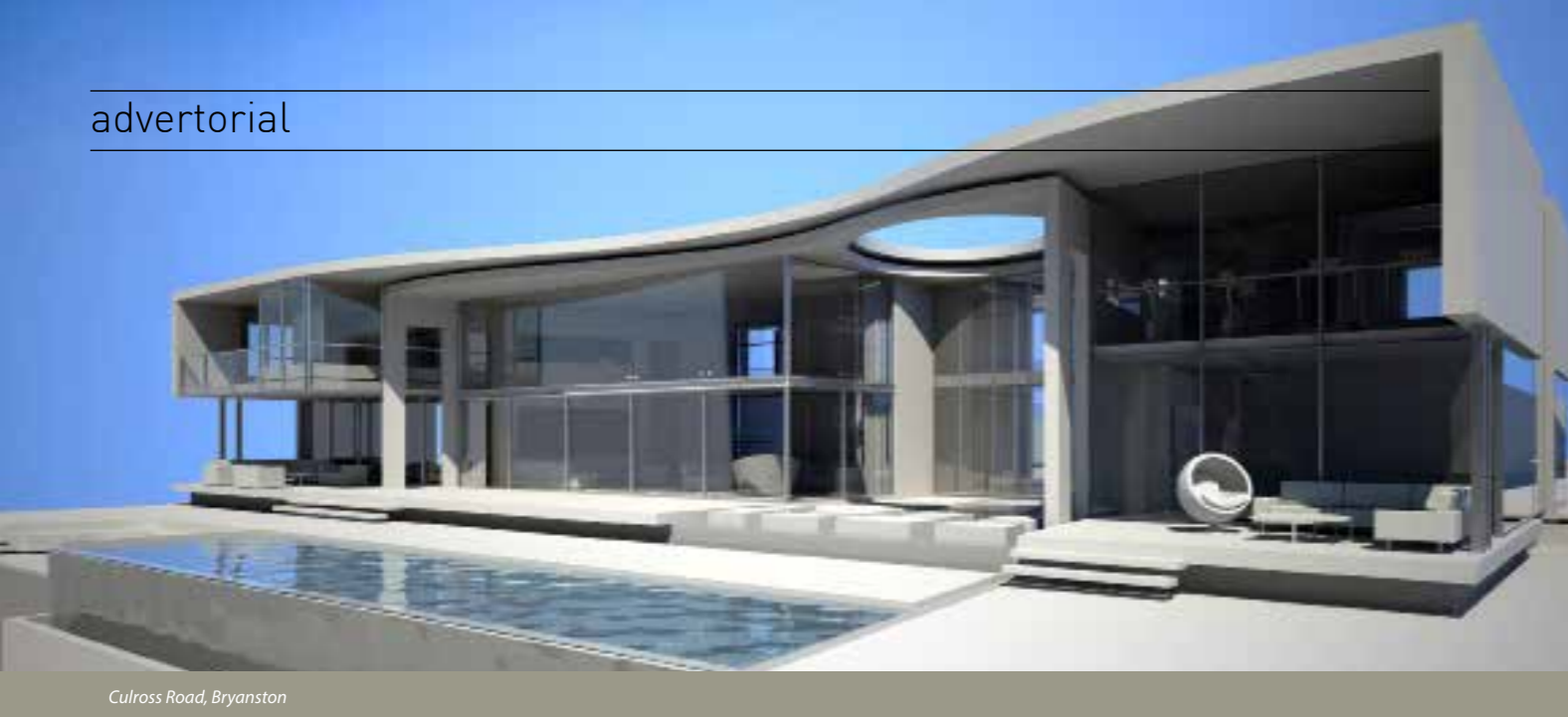
Culross Road, Bryanston

is currently on hold. It's an awesome project that merges two realms with two distinctive layered forms. On entry you experience a public realm of spaces – lobby, living, family, kitchen and veranda. These are contained in a geometric form surrounding the open-plan spaces. This component is then overlapped by an organic form, which envelopes the private realm where the bedrooms, gym and study are situated. The design is unusual, creative and feminine; it reflects the owner's personality."