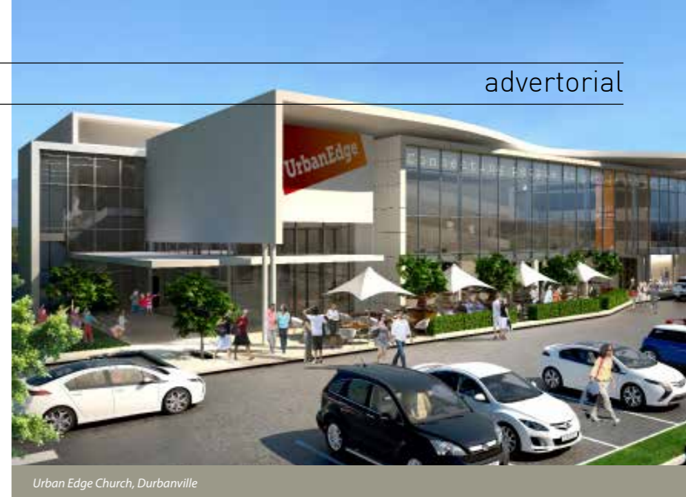
Urban Edge Church, Durbanville

"This is inner-city rejuvenation at its best. It's a collaborative effort by all involved – and ultimately, the city is the client."