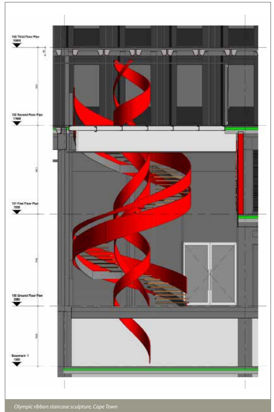
Olympic ribbon staircase sculpture, Cape Town