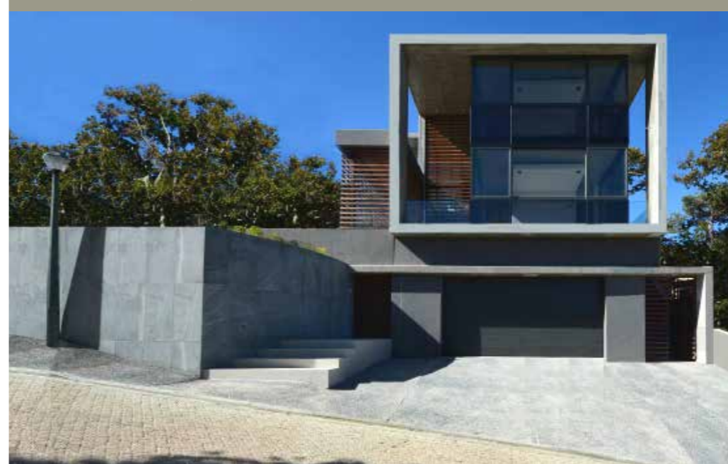
Thorn Street, Newlands